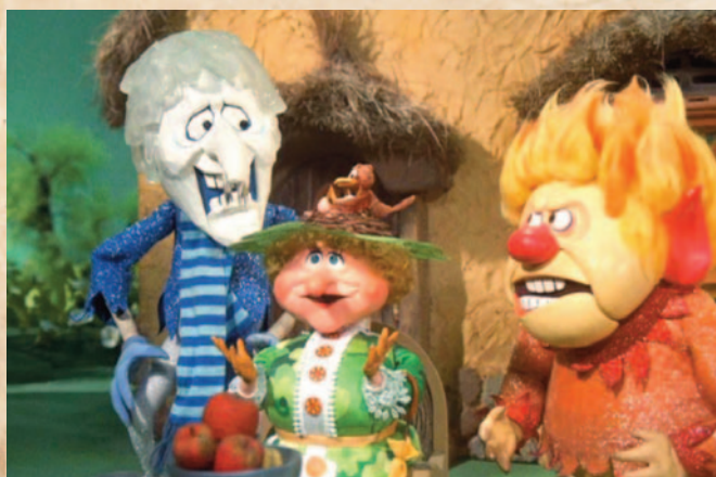
Mother Nature, their mother, steps in to the conflict and works out a deal with Mrs. Claus that will help prove to the people of Southtown that there truly is a Santa Claus.