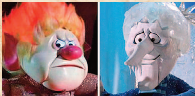
The Miser Brothers, Heat Miser and Snow Miser, who control heat and cold respectively. They constantly battle with each other to make the Earth warmer or colder.