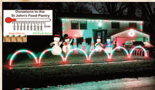
The Hughes Digital Christmas is a professional-grade Christmas display right in our own backyard at 2S231 Valley Road. All donations are given to St. John's Food Pantry.

Consider using GFI adapters if your outlets don't have one. Because plugs and cords can end up in wet conditions. It is good idea to make sure the power will turn off if a short hap-